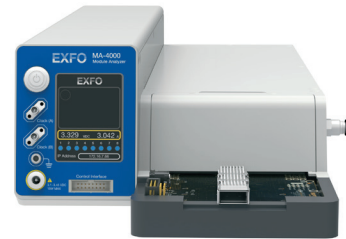
Minimized thermal chamber for industry's fastest thermal cycling