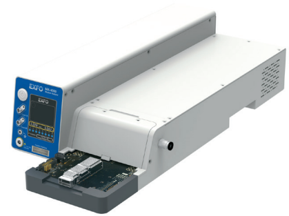
Easy-to-replace MCB in direct contact with BERT