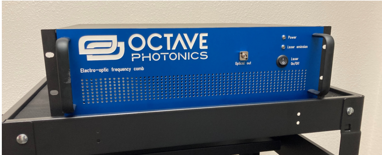
19-inch-rack-mount Base EO comb.

Summary: Electro-optic laser frequency combs (EO Combs) from Octave Photonics provide a reliable method for generating femtosecond frequency combs at repetition rates between 5 and 30 GHz. Octave Photonics specializes in building EO combs with ultra-low phase noise, octave-spanning bandwidth, and femtosecond pulse durations. Applications include spectrograph calibration and dual-comb spectroscopy.