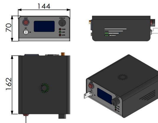
162(L) × 144(W) × 70 (H) mm 3 , 1.0kg