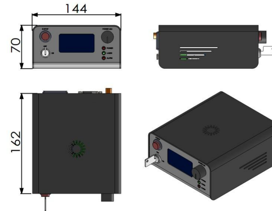
162(L)×144(W)×70(H) mm 3 , 1.0kg