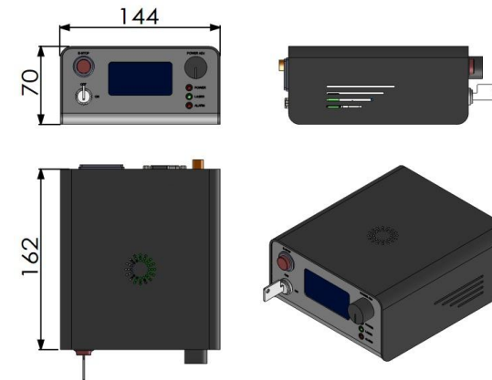
162(L) × 144(W) × 70 (H) mm 3 , 1.0kg